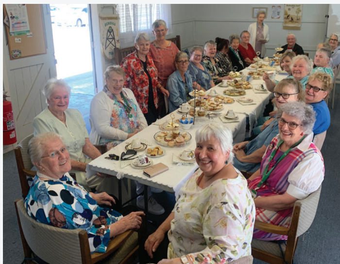
International Day at Bendigo Branch