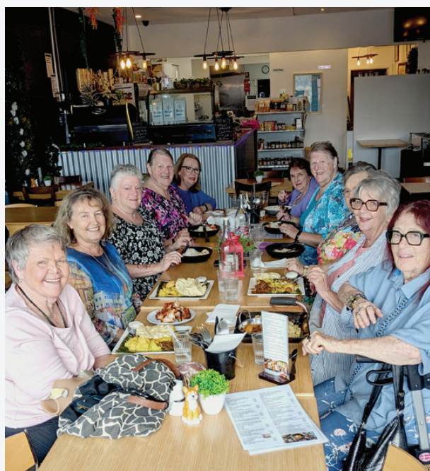
Frankston Branch at Ceylon Girls

We were all so impressed with the food we will likely visit again soon.