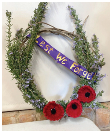
Wreath made by Rosewhite and District Craft Group