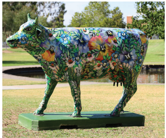
Shepparton cows