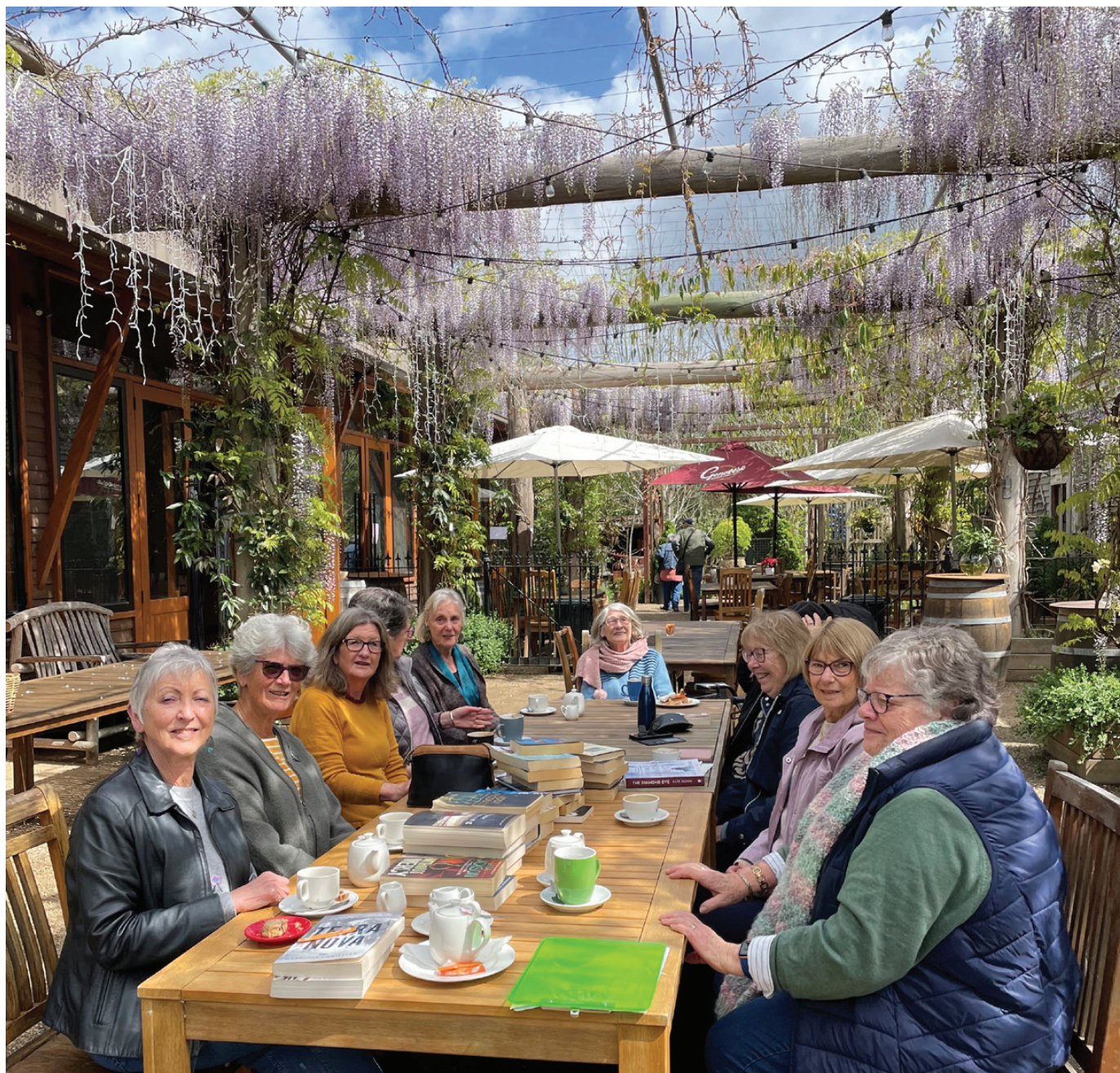
Tarrawarra Branch Book Club