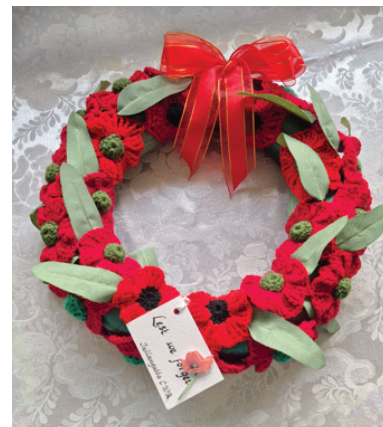
Tallangatta Branch Wreath