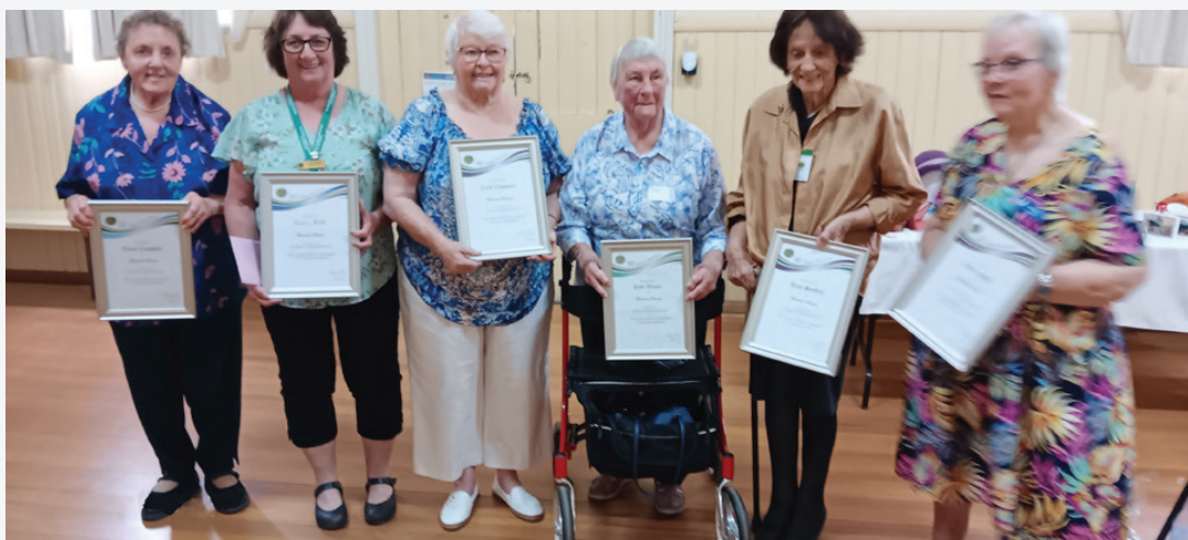
Barrabool Branch Service Awards